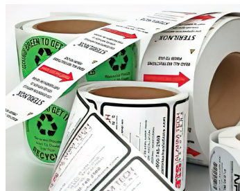
▲ Durable labels are made with polyester, nylon, Kapton, vinyl, valeron and other synthetic materials.