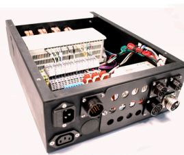
▲ Electronic assembly.